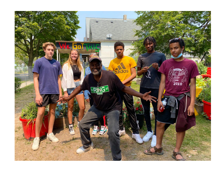
We Got This Milwaukee – Community Garden

Health Empowerment Fund students and Milwaukee-area students spent the day together working at the food pantry. They learned that inner city health issues are complex, but neighborhoods and neighborhood leaders can have a huge impact.