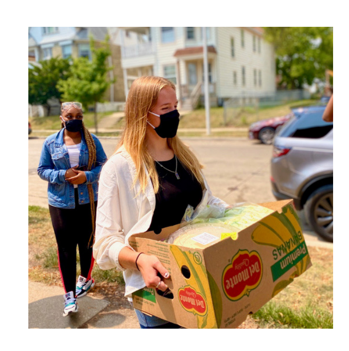
Food Pantry – Milwaukee, WI

Health Empowerment Fund students and Milwaukee-area students spent the day together working at the food pantry. They learned that inner city health issues are complex, but neighborhoods and neighborhood leaders can have a huge impact.