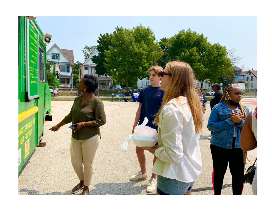
Back to School Fair – Milwaukee, WI

This community garden exemplified how a neighborhood leader can successfully improve health, employment, and safety through community-level action.