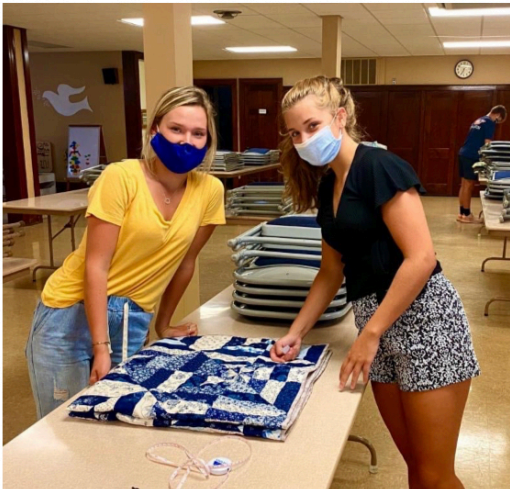
Monroe/ Green County (Rural)