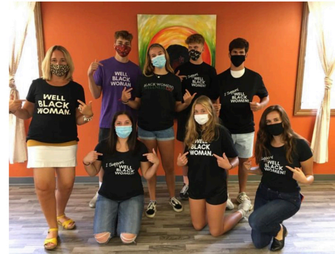
Madison (Health Equity)